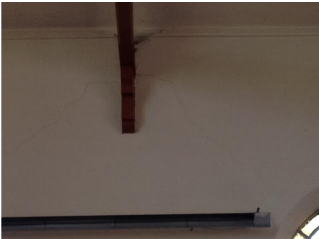
Image 5: Shows wall cracking under weight of roof having effect onto windows.